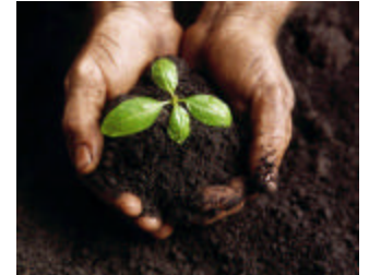
The growth of the Foundation depends on the support of our donors!

close to without an education. To date the Foundation, with your help and generosity, has helped 14 women to fulfill their dreams and to start down a path of new opportunities.